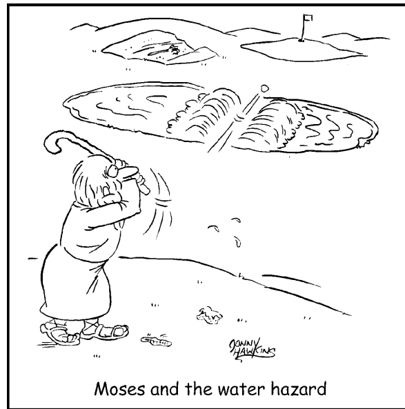
Moses and the water hazard